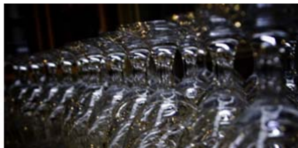
photo: #1, a steamy sparge, the last of the season at Boon. #2, Palm glasses awaiting the visitors